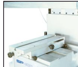
- Work table