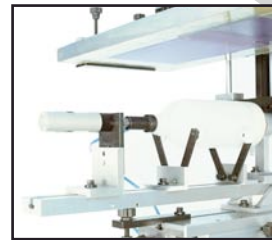
- Air inflation unit