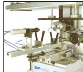
- Registration unit