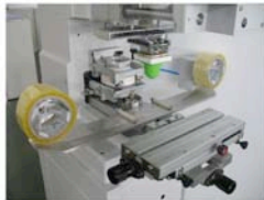
Automatic Pad Clean Function